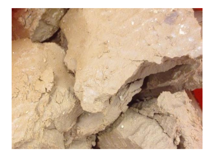
Figure 1. Alum Sludge Collected from Atlanta-Fulton Water Treatment Plant

Compared to 87% of chloride removal with the usage of aluminum sulfate, around 75% of chloride can be removal with the usage of the alum sludge. Although the removal efficiency was not as good as aluminum sulfate, alum sludge is a great substitute for aluminum sulfate because it costs nothing. In addition, this treatment proves also provides a means of alum sludge disposal. Typically, 20 mg/l (aluminum equivalent) should be able to achieve the chloride removal goal (Figure 2).