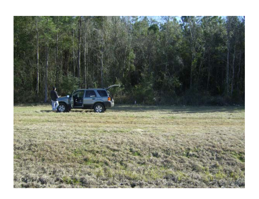
Leon County Landfill