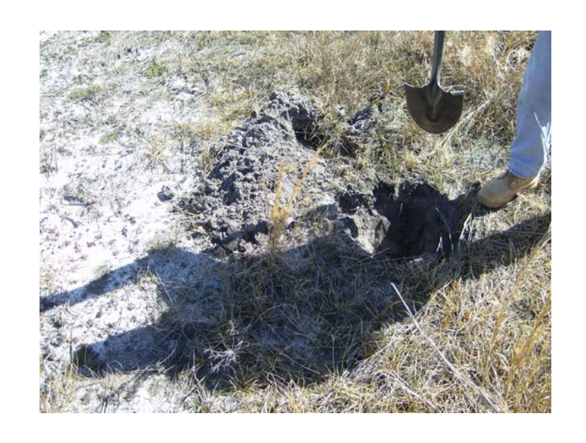
Franklin County Central