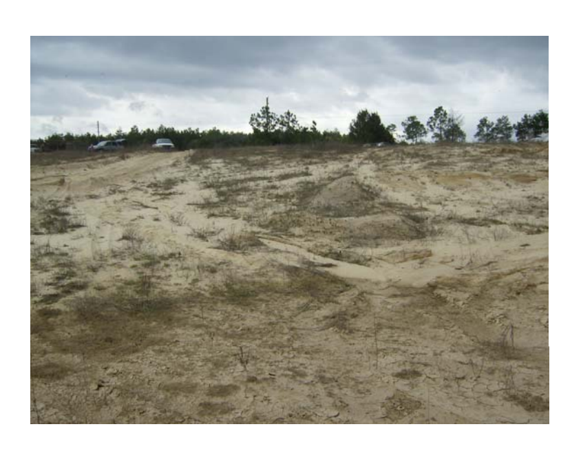
Steelfield Landfill, Bay County