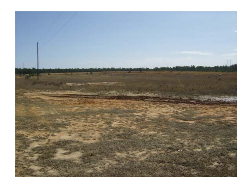
Santa Rosa Central Landfill