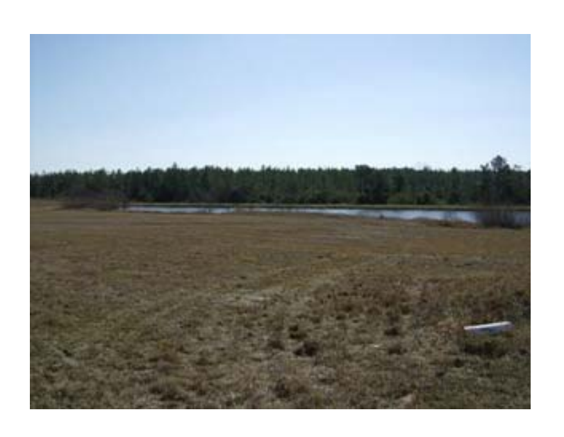
Holmes County Landfill