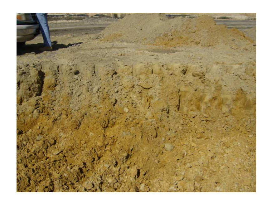
Spring Hill South landfill Jackson County