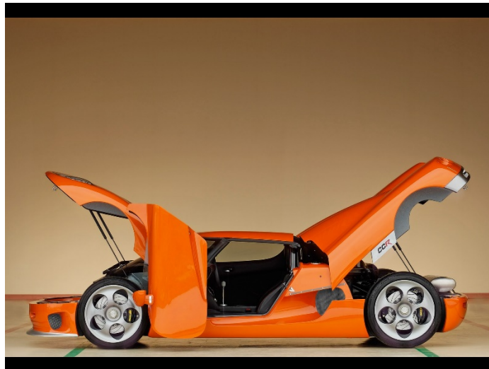
Figure 1. Flush left, normal font settings, sentence case, and ends with a period.

The text above the caption always introduces the reference material such as a figure or table. You should never show reference material then present the discussion. You can split the discussion around the reference material, but you should always introduce the reference material in your text first then show the information. If you look at the Figure 1 below the caption has a period after the figure number and is left justified whereas the figure itself is centered.