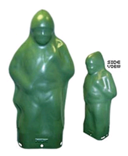
Figure 2b. "Ivan" Style 3D Target