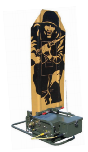
Figure 1. Example of SIT