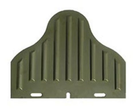
Figure 2d. "F" Style Target