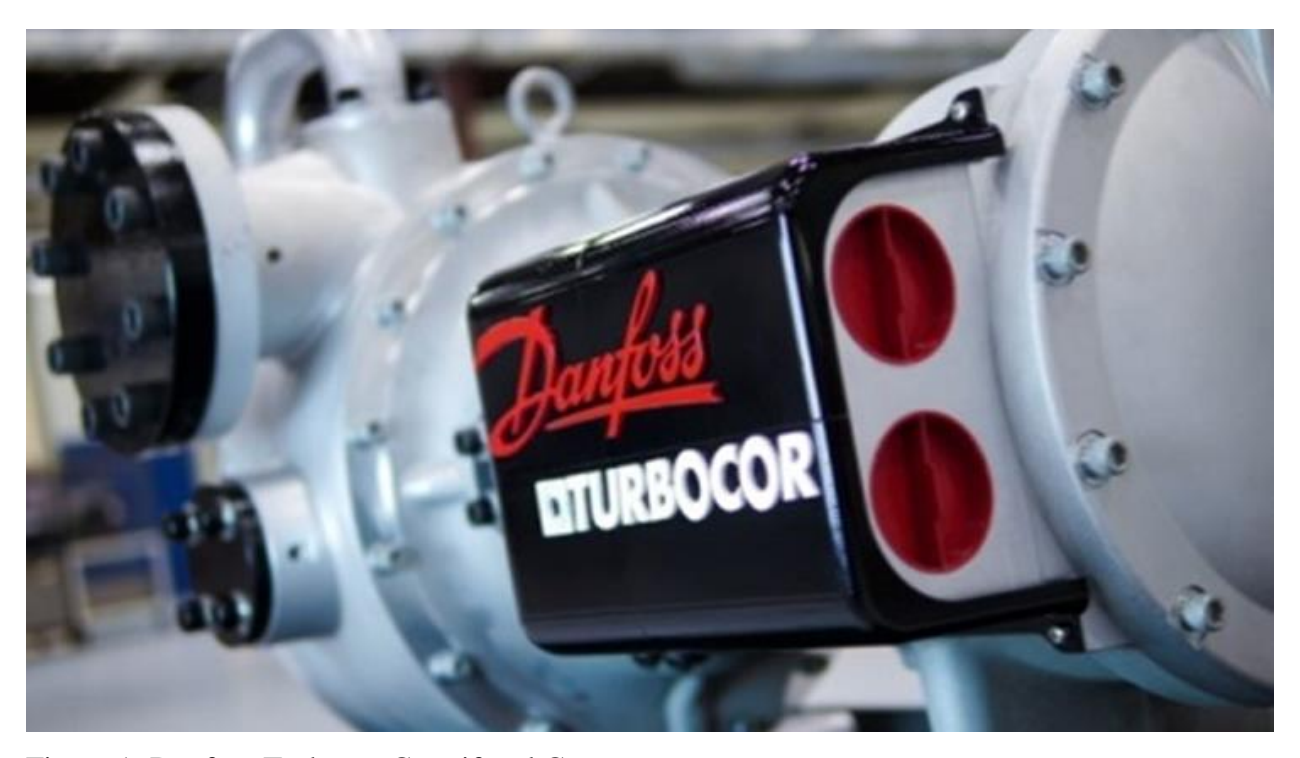
Figure 1: Danfoss Turbocor Centrifugal Compressor