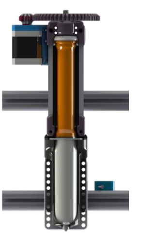
Figure 2 Syringe Pump Designed to be Mounted on a 3D Printer

The syringe pump will be controlled by either an Arduino microcontroller, or directly from the RAMBO controller board on the TAZ 4 3D printer. Using a design from PIULabs in Milan, the team can mount a syringe pump directly onto the p design is optimized to use a