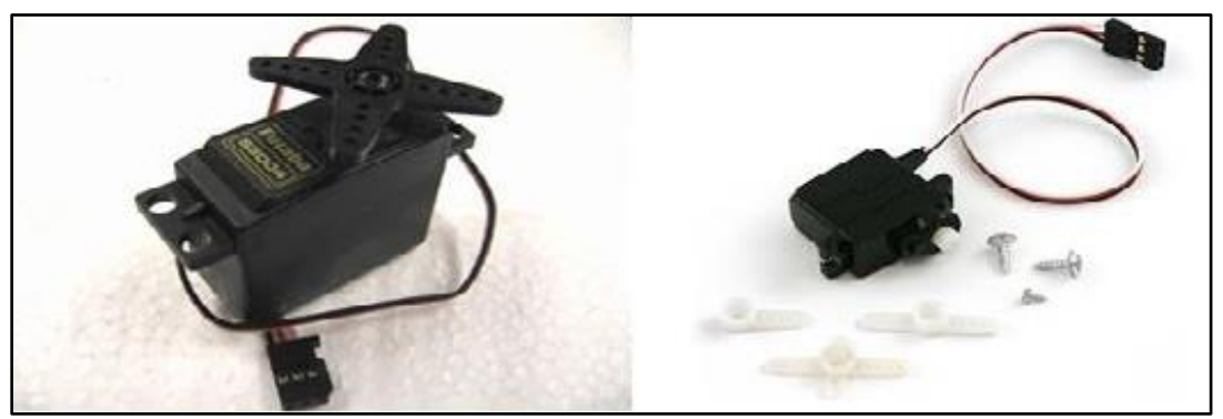
Figure 2: Current Servo (right). Ideal Servo (left)

The first gimbal system inherited by team 6 was designed for a Sony block camera, which was oversized and excessively heavy for flying purposes. As the camera needed to be changed because of flat cable replacing problems, the system had its dimensions reduced and unnecessary parts removed. Although it became a lot more efficient, it still could be rebuilt (in case more time was available) in an even more effective way. One important step for upgrading it would be the change of the Futaba 180 degrees standard servos that runs the equipment for smaller ones. In the pictures below it is possible to see the current servo type (left) and the ideal one (right).