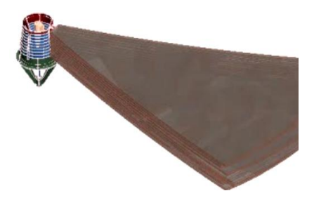
Figure 1 shows the stowed positioning of the panels in which they rest on top of one another.

Our center of attention is on the latching mechanism used to engage and hold the panels in their final, flush positions. The panels are initially in a stowed position stacked on top of each other as can be seen below in figure 1.