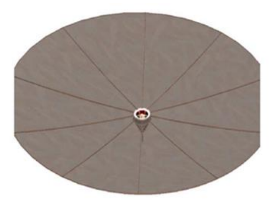
Figure 3 shows the panels in their fully deployed configuration in which the panels are both vertically and horizontally flush with one another.

The latching mechanism will be designed to engage in the linear motion phase of deployment. Ideally, it will be a passive design. It must securely hold each panel flush with their two adjacent panels and must be a reliable design.